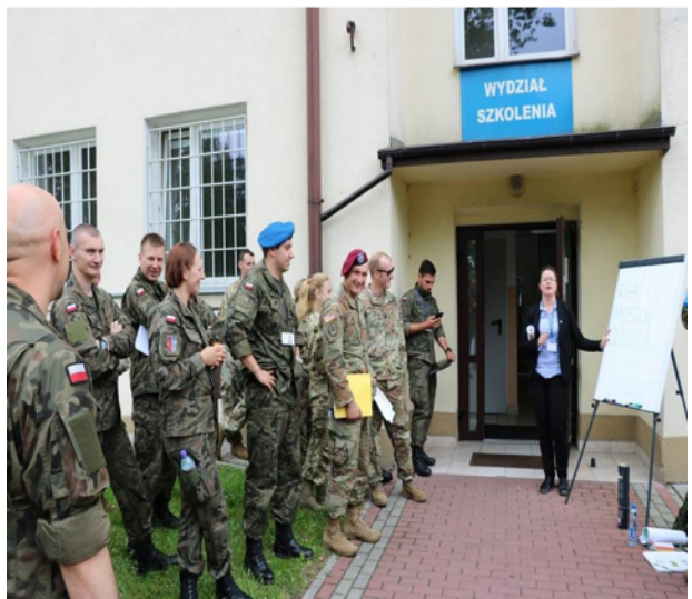
Graph 2. Interactive simulation during CCOE NFSWC in Poland