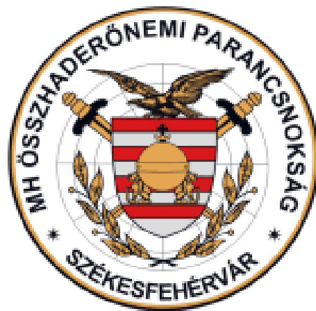
Hungarian Defence Forces Joint Command

On 1 January 2007 the Civil-Military Relations Branch (HDF JFC J9) was established within the structure of the HDF Joint Force Command as the operational level organisation.