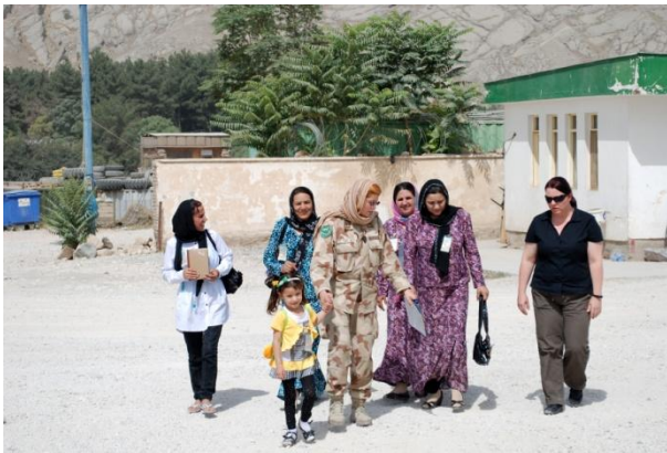
Women Affairs (HUN PRT)