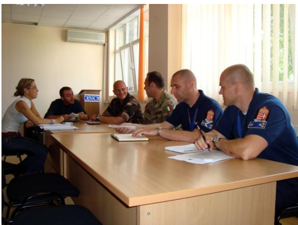
Weekly meeting (OSCE, KFOR, UNMIK, EULEX)

The second largest mission of the HDF, the HUN KFOR Contingent was also supported by a CIMIC Team to gain more acceptance and recognition from the local population and the authorities.