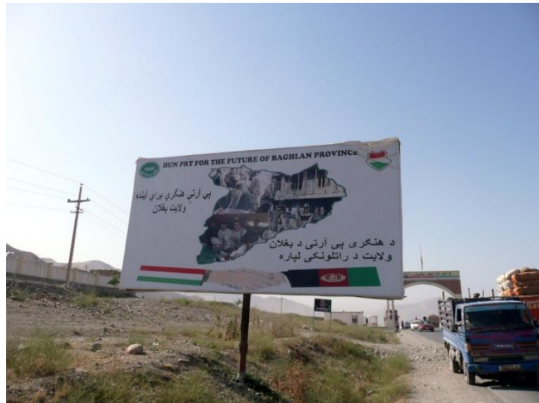
We are here for peace (HUN PFT)

In accordance with Hungary's NATO commitment HDF CMCPoc began to take part in missions: