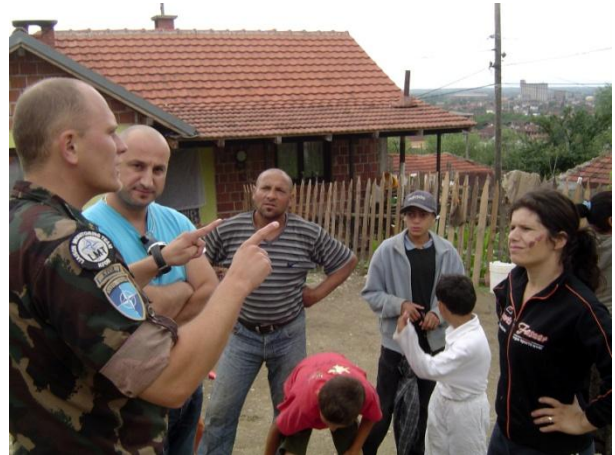
Pulse patrol – liaison – in Pec/Peja

Hungary run two LMTs - presently one - also manned by the HDF CMCPOC to execute the most important core function of CIMIC, liaison.