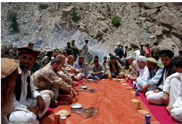
Celebration with locals (HUN PRT)

The second largest mission of the HDF, the HUN KFOR Contingent was also supported by a CIMIC Team to gain more acceptance and recognition from the local population and the authorities.