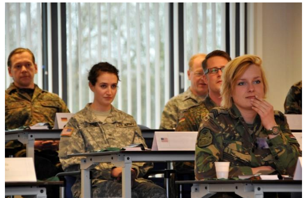
Picture: International Cadet Event 2014

writing her Masters' Thesis on Anti-Corruption under co-supervision of the 'Rijksuniversiteit' Groningen and the CCOE. This project continues an earlier elaborated project on the topic 'Money as a Weapon'. With the same spirit, the CCOE will conduct an International Cadet Event for junior officers and officer cadets that are studying at the Military Academies of the CCOE's Sponsoring Nations and the United States Military Academy West Point.