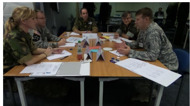
Picture: Participants discussing a case study

During the whole course, practical case studies (real life experiences) were the red line throughout.