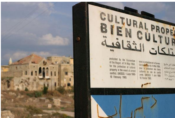
Picture: The ancient city of Tyre as protected cultural property.