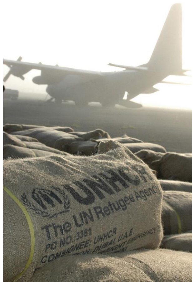
packages