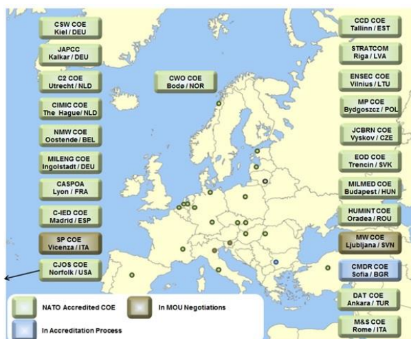
Picture: Overview COEs

All NATO Centres of Excellence (COEs) are International Military Organizations that provide subject matter expertise and related services tailored to the need of the alliance but funded by so called sponsoring nations. What they have in common is their nature of being outside the formal hierarchy of National and NATO Command Structures, which is unique in the military environment. This organizational setting does not only promote flexibility and agility, it also allows COEs to build bridges into other domains, such as the industry and academia - as networking (collecting, assessing and sharing information and knowledge) is an integral part of their design.