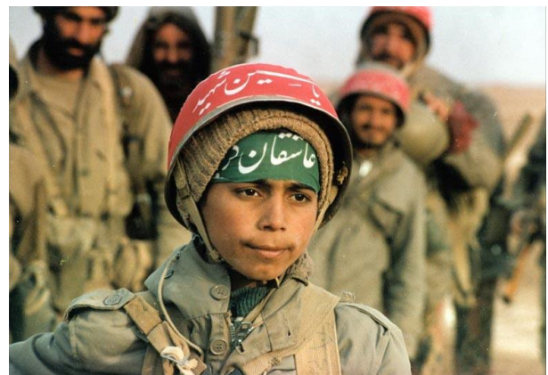
Picture: An Iranian child soldier during the Iran-Iraq war.

"The Lubanga case is noteworthy as it was the first in its kind that demonstrated a general stance on the fact that the line between voluntary and forced recruitment is irrelevant concerning children's association with armed forces and groups during conflict. The Court also applied the broad interpretation of "active participation in hostilities" in order to assure that justice could be obtained for all children associated with the Congolese armed groups, for both boys and girls and, irrespective of whether they carried a weapon, or functioned in an (unarmed) supporting role." 19