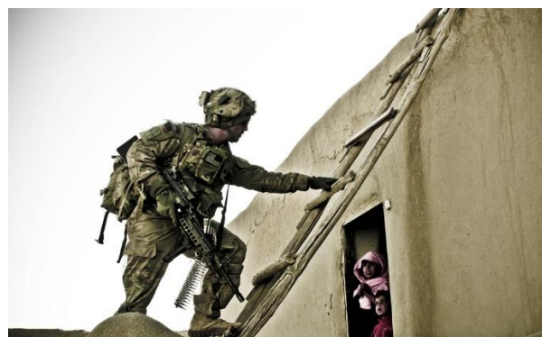
Picture: Children looking at a soldier performing his duties.

NATO has issued military guidelines on CAAC and installed a CAAC Focal Point at Supreme Headquarters Allied Powers Europe (SHAPE). In addition, NATO offers an e-learning comprehensive course module which covers the legal foundation of children, identifies legal and policy obligations of military personnel and aids in becoming familiar with examples of authorized actions.