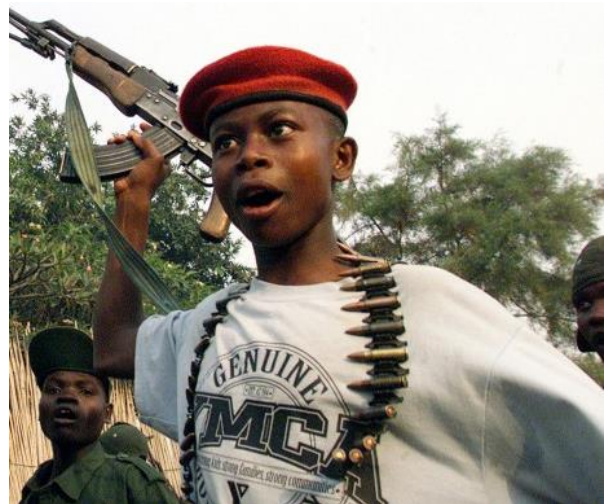
Picture: A child soldier.

The increased recruitment of children in armed conflict has severe implications for the military. Though the general rule is that those people who are fighting you are the legitimate targets of attack, one can question whether it is morally just to target children, even when armed. 22 Consequently, diverging perceptions on the use of children in war, can create a situation in which both the moral and the resilience of (Western) military personnel is put to the test. Accordingly, if a nation wishes to wage war ethically, these are matters that need to be considered in advance and demand adequate integration into every soldier's pre-deployment preparation.