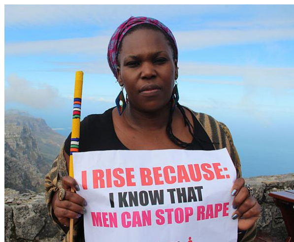
Picture: Making a statement to put an end to sexual violence.

Sexual violence has increasingly become a part of conflict and is in some instances used as a tactic of war. Sexual abuse can take various forms, such as rape, sexual slavery, enforced prostitution, forced pregnancy, and enforced sterilization as described in the Rome Statute. 15 It has severe and devastating consequences. Child victims suffer long-term health issues such as psychological trauma, sexually transmitted diseases and early pregnancy. Reintegration of the latter is a challenge in itself as communities often stigmatize girls that carry babies of rape. Boy victims of sexual violence should not be overlooked nor should the trauma boys face as witnesses or perpetrators of sexual violence.