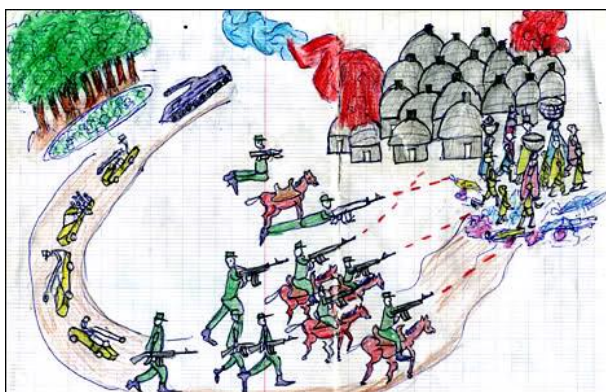
Picture: The effects of experiencing armed conflict during childhood can be visible in many ways.