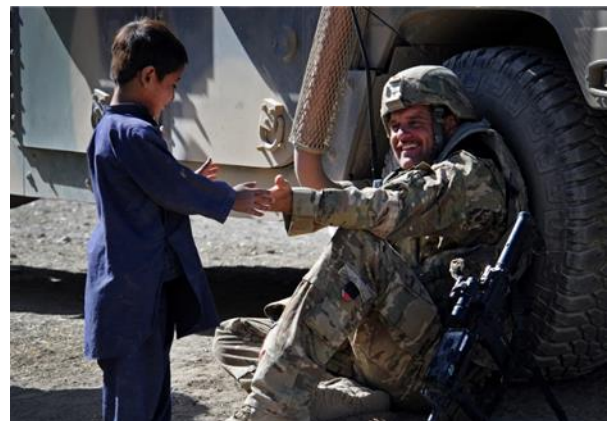
Picture: A soldier in contact with a local child.

In Afghanistan members of the International Security Assistance Force (ISAF) HQ and NATO Training Mission Afghanistan (NTM-A) worked closely with the Child Protection Advisor of the United Nations Assistance Mission in Afghanistan (UNAMA) to create a pocket guide for international military forces on how to report cases of the recruitment of children within Afghan National Security Forces or Armed Groups and to report all forms of sexual violence against children. A special focus was put on the issue of Baccha Baazi or "boy plays" [literal translation].