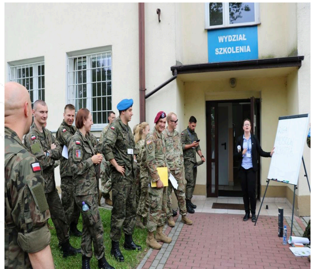
Graph 2. Interactive simulation during CCOE NFSWC in Poland