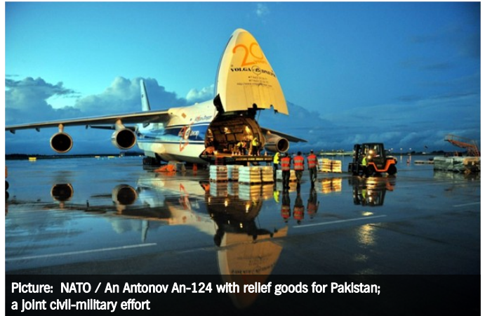
An Antonov An-124 with relief goods for Pakistan; a joint civil-military effort

response. CIMIC's role in this would be to effectively help a military commander to steer the process with civilian agencies to reach the desired mission objective. The implementation of both doctrines hasn't been a smooth ride though, most probably due to the perceived military ownership.