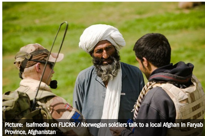
Norwegian soldiers talk to a local Afghan in Faryab Province, Afghanistan

It sure would have raised some eyebrows in the offices in Brussels, Geneva, and New York when they took notice of the fact that NATO was going to focus on reconstruction and development schemes. But surely beyond the initial bewilderment there must have been some fear among the policy planners of the large International Governmental Organizations (IGO) of being overshadowed by NATO's efforts. 20 Possibly because of this slight hint of suspicion, the relationship between NATO and other IGOs hasn't fully evolved yet to a fruitful standard. It also poses the practical dilemma of where should NATO's crisis management mandate end and where should those of the IGOs begin? This dilemma is of course also inherent to the internal NATO discussion on how civilian does the Alliance wants itself to be. In this sense NATO might benefit from keeping to its military roots since the most military action can do is create stability and a space in which a civilian process can be established, by for instance UN agencies. 21