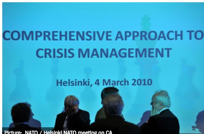
Helsinki NATO meeting on CA

The interference of military activities within the civilian domain has led to some irritation among the civil agencies. NATO should try to improve its relation with the civilian agencies first by raising its awareness on civilian doctrines, culture of organization, and project conduct. It should open up the dialogue with the civilian sphere and share information in order to create some mutual awareness of each other. Due to the current operational support function of CIMIC, military in the field rather see civilian agencies do work that fits within their aim; if they do not wish to collaborate they are seen as obstructionist. This is a grave misconception of the efforts of the civilian organizations and it is not a proper starting point for a sustainable relation.